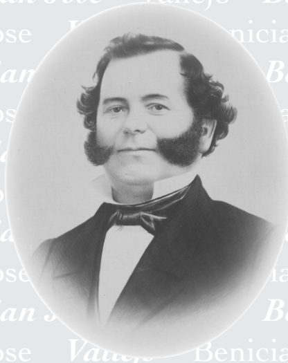
Mariano Guadalupe Vallejo 1808-1890