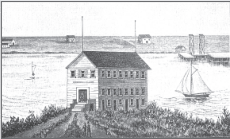
Capitol at Vallejo—1852-53

On January 14, 1851, General Vallejo presented a communication to the Senate offering bonds as security for the fulfillment of his proposal. A majority of the Senate Committee on Public Buildings reported a bill recommending removal of the capital to the town of Vallejo which, passing both houses, was approved by the Governor on February 4, 1851. 5 California's first State Capitol site is now marked with a plaque across from the Plaza de Cesar Chavez on South Market Street in downtown San Jose.