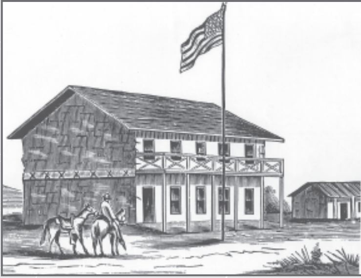
Capitol at San Jose—1849-51