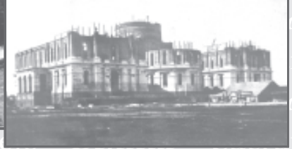
Capitol under construction — 1860-74