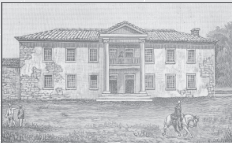
Colton Hall, Monterey Site of Constitutional Convention of 1849