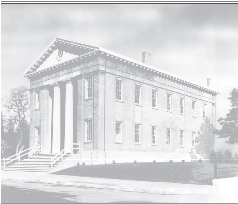
The old State House (as restored)

California Sesquicentennial 1850–2000 Commemorative Session of the State Legislature