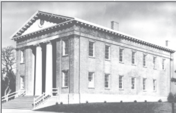
Capitol at Benicia — 1853-54