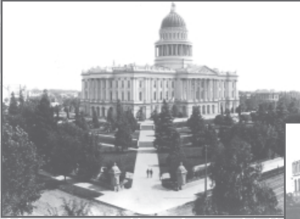
McCapitol at Sacramento 1874-present