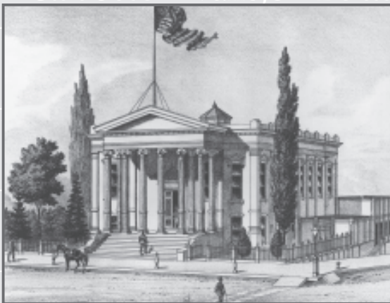
Second Capitol at Sacramento 1855-69