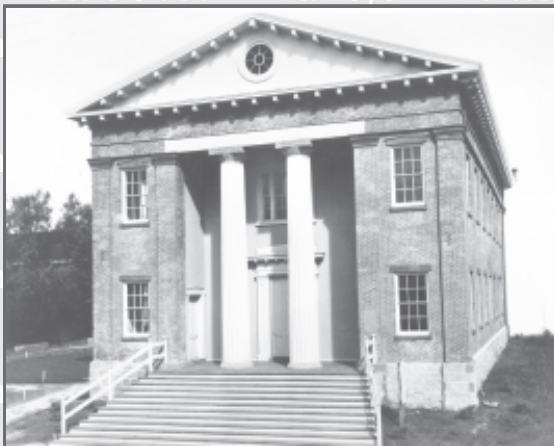
Restored Benicia Capitol Building Site of the Sesquicentennial Commemorative Session