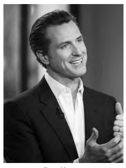
GAVIN NEWSOM GOVERNOR OF CALIFORNIA