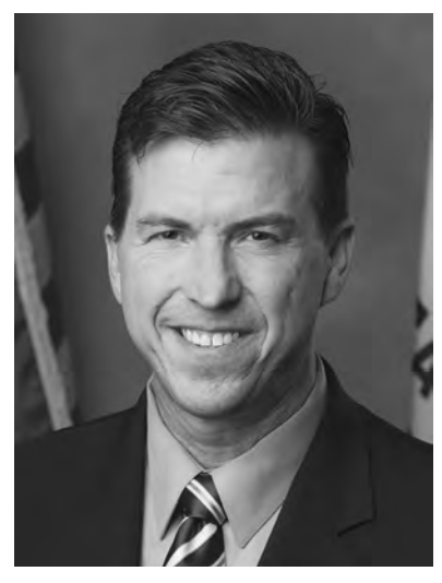
KEVIN MULLIN SPEAKER PRO TEMPORE OF THE ASSEMBLY