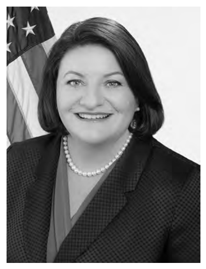
Toni\,G.\,Atkins president pro tempore of the senate