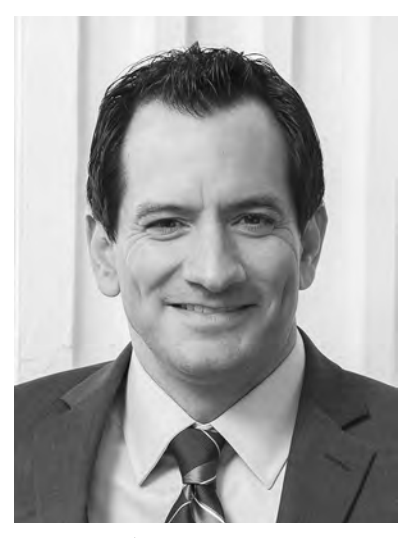
ANTHONY RENDON SPEAKER OF THE ASSEMBLY