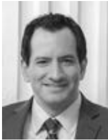
Anthony Rendon (D) Mar. 2016–