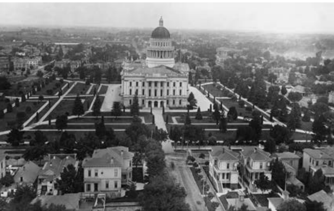
Capitol Grounds, circa 1890 (photo taken from hot air balloon)