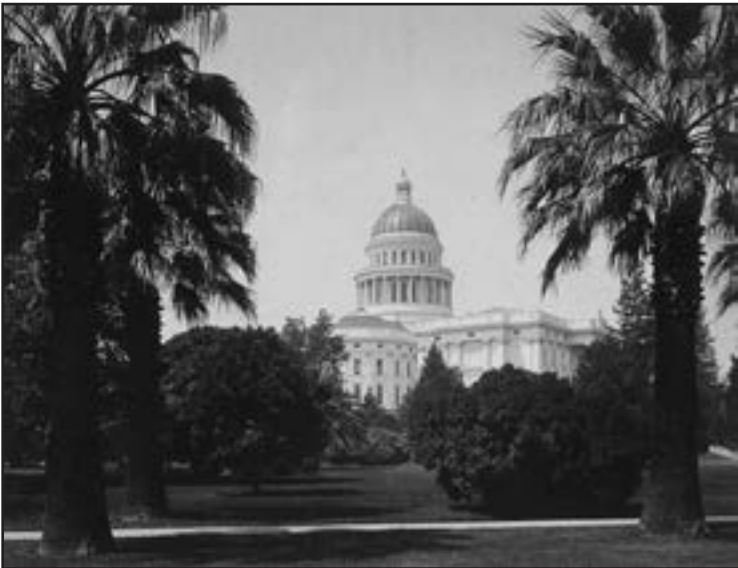
California's Capitol, circa 1910.