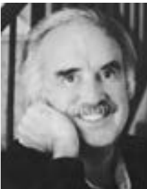
John L. Burton (D) Feb. 1998–Nov. 2004