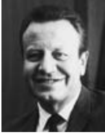
Jesse M. Unruh (D) Sept. 1961–Jan. 1969