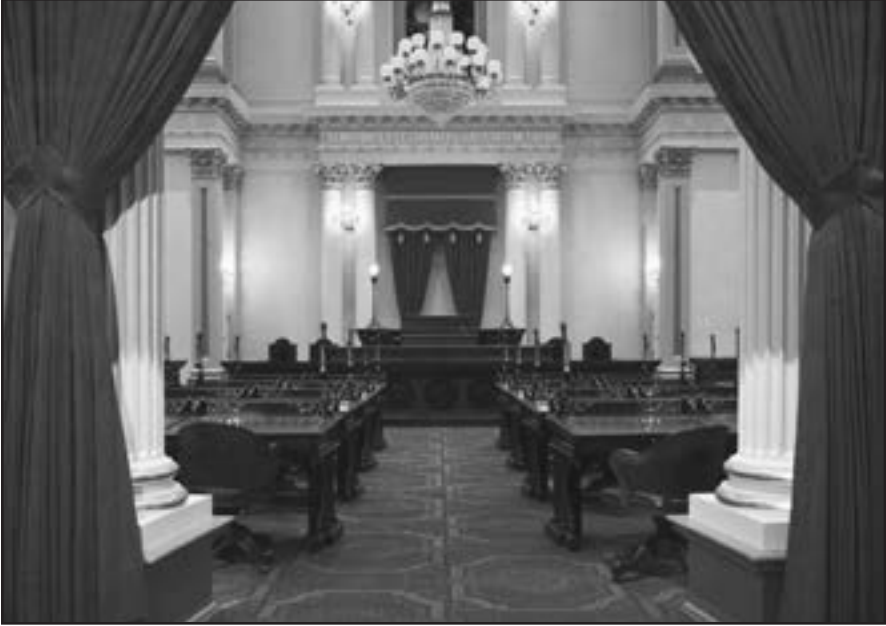
The California Senate Chamber