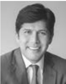
Kevin de León (D) Oct. 2014–