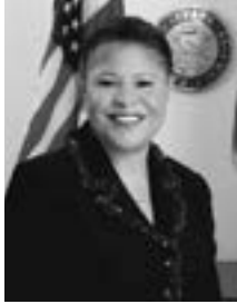
Karen Bass (D) May 2008–Mar. 2010