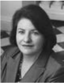
Toni G. Atkins (D) May 2014–Mar. 2016