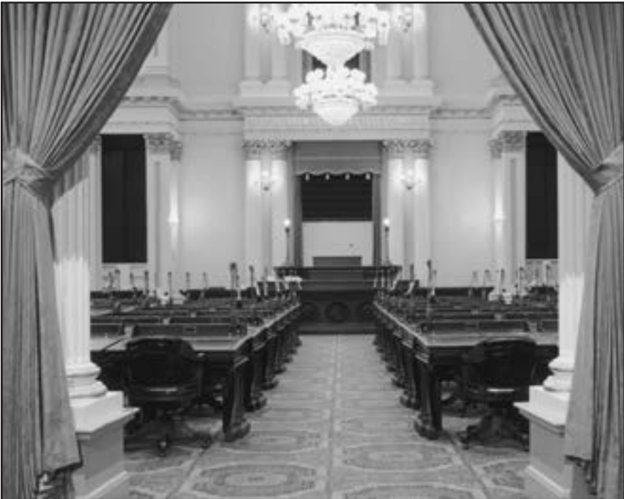
The California Assembly Chamber