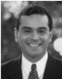
Antonio R. Villaraigosa (D) Feb. 1998–Apr. 2000