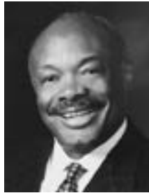
Willie L. Brown, Jr. (D) Dec. 1980–June 1995