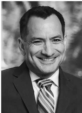
ANTHONY RENDON SPEAKER

RENDON, Anthony (D) 62nd District. Elected to the Assembly 2012. Sworn in as the 70th Speaker March 7, 2016. In 2017, Rendon led a progressive and productive legislative session during which the Assembly passed a landmark $52 billion transportation funding plan and legislation to address the affordable housing crisis. In 2016, the Assembly passed the nation's first $15 minimum wage, extension of California's climate change reduction goals, overtime pay for farmworkers, and groundbreaking policies on gun and tobacco use. Speaker Rendon promotes environmental and economic equity for disadvantaged communities like the one he represents, and has supported local culture to preserve community integrity. Recent laws under his leadership include police use-of-force reform, free universal pre-kindergarten, historic investment in California's students, clean lending laws, increased affordable housing production, and water quality aid for communities in need. Prior to serving in the Assembly, Anthony Rendon was an educator, non-profit executive director, and environmental activist. He attended Cerritos Community College and California State University, Fullerton and earned a Ph.D. from the University of California, Riverside. He resides in Lakewood with his wife, Annie, and daughter, Vienna.