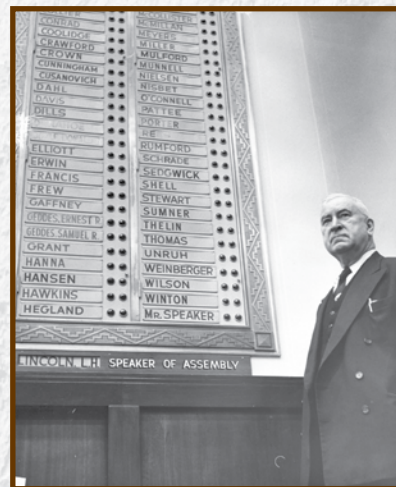
Ohnimus in front of vote tally board, circa 1958.

Ohnimus was censured and later cleared in 1925, for his role in a Capitol bribery scandal involving Chinese herbalist legislation.