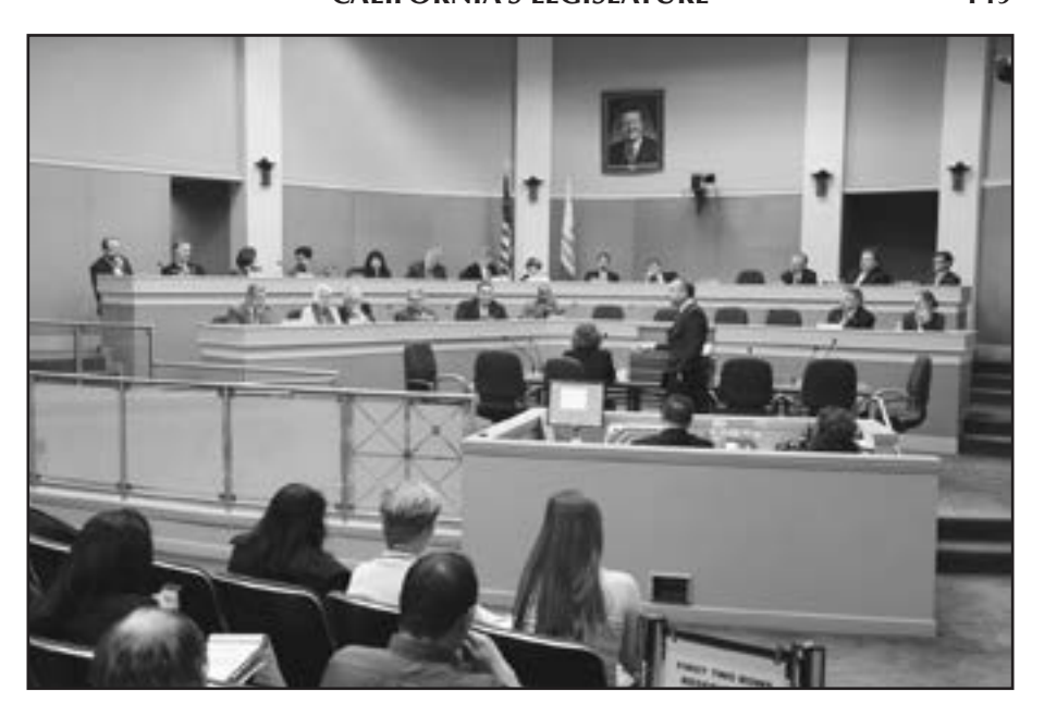
An Assembly Committee meeting in 2010.