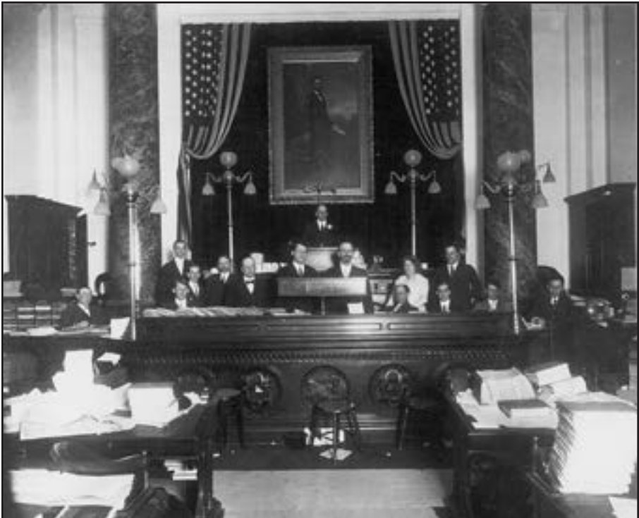
California Assembly in Session, circa 1910

The Legislature currently meets in a two-year session as a result of a constitutional amendment (Proposition 4) adopted in 1972. The Legislature convenes on the first Monday in December of the even-numbered years (e.g., December 3, 2012) and must adjourn by midnight November 30 of the following even-numbered year (e.g., November 30, 2014). 23 The first biennial session (1973–1974) saw the Legislature adjourn on September 1, 1974, well in advance of the constitutional deadline. This practice has been followed in each successive biennium and is likely to continue because