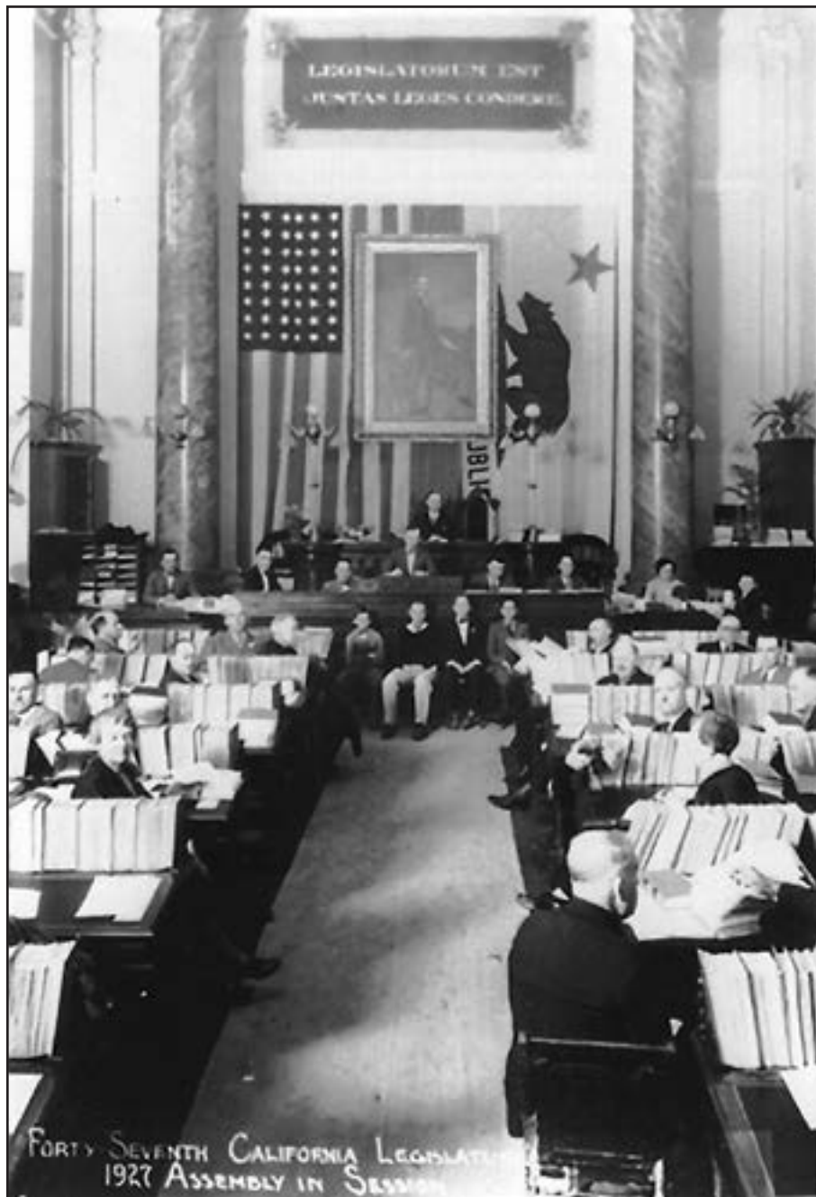
The California State Assembly in Session, April 26, 1927