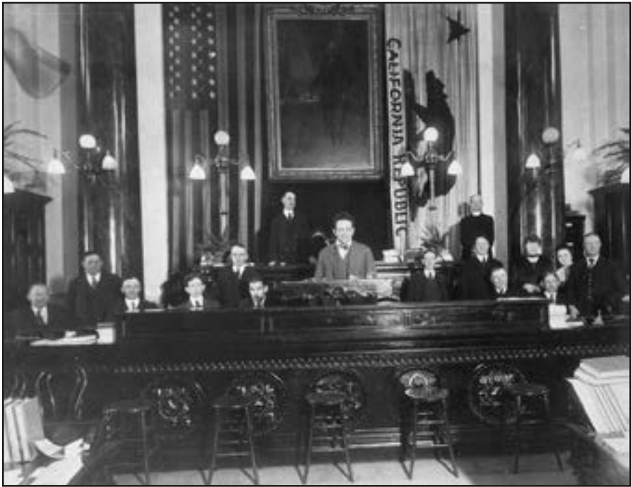
California Senate in Session, circa 1917

News of the admission of California into the Union reached San Francisco on October 18, 1850, months after the adjournment of the First Legislature, which adjourned on April 22, 1850, having been in session a little more than four months.